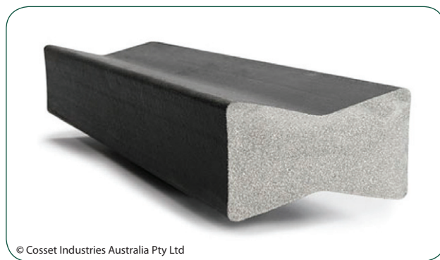
© Cosset Industries Australia Pty Ltd