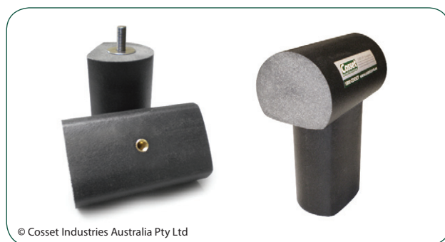
© Cosset Industries Australia Pty Ltd