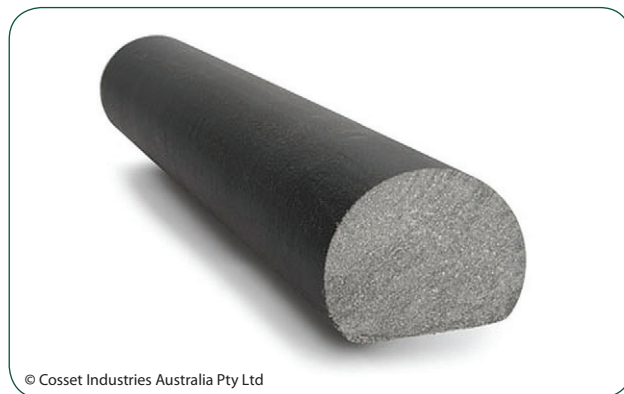
© Cosset Industries Australia Pty Ltd