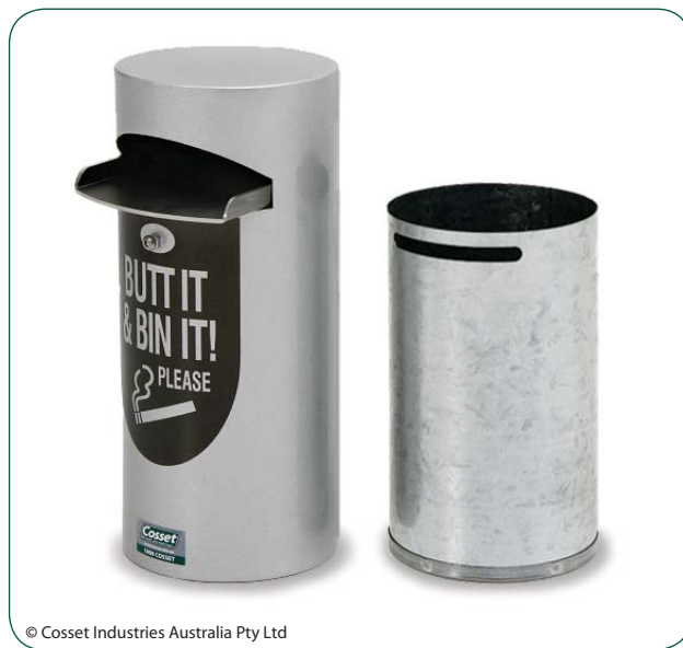
© Cosset Industries Australia Pty Ltd