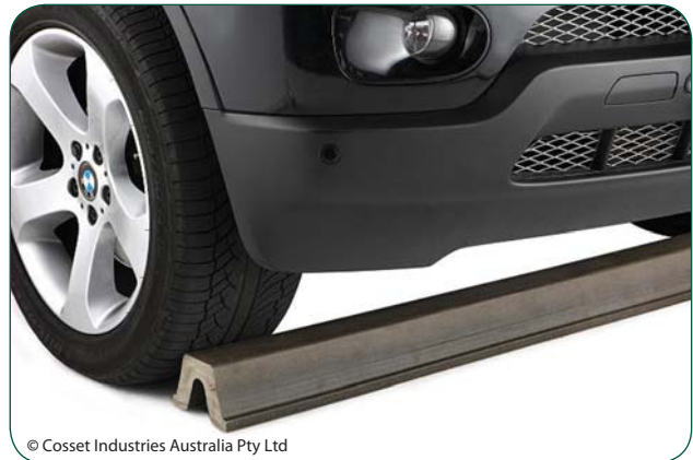
© Cosset Industries Australia Pty Ltd