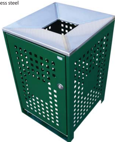
© Cosset Industries Australia Pty Ltd